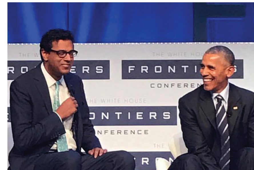
Dr. Atul Gawande had an opportunity to share his ideas about the next century of health care advancement with President Barack Obama during the presidential plenary on the future of medicine and health care at the White House Frontiers Conference.

Executive Director Atul Gawande testified on an expert panel before the U.S. Senate Special Committee on Aging about improving care for seriously ill patients. He recommended incorporating measures of quality of life into Medicare's nursing home/hospital ratings system and removing requirements that terminal patients give up curative care to receive hospice services supporting their quality of life.